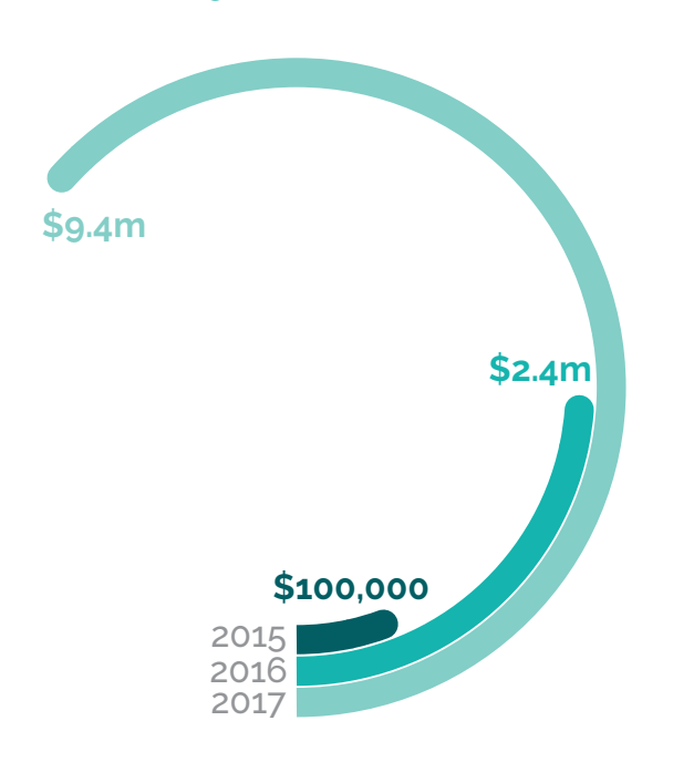
P2P Business Lending and Online Debt-based Securities | 2017 By Platform